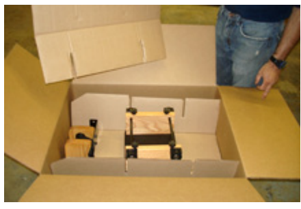
Step 5.) Take the next slotted cardboard insert and slide the slots on one side into the slots on the bottom piece of cardboard. Fold the top piece over the seat and do the same to the other side. Press down gently to secure it in place.