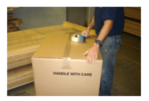
Step 1.) Starting with the top of the box, tape along the seam, then along the sides. Once finished, turn the box up-side down.