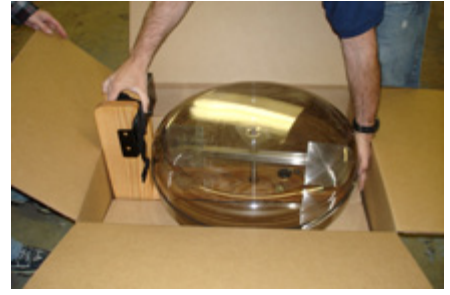
Step 4.) Slide the slotted cardboard insert with a notch cut out over the tank assembly in the box. Make sure the sides are folded up. Place the seat on top of this insert with the wheels up.